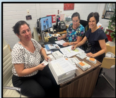
Last minute preparations for Presentation Day 2023