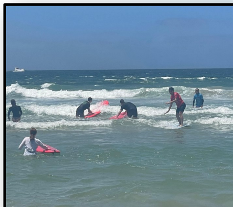
Scenes from this week's Year 9 Surf School at Cronulla