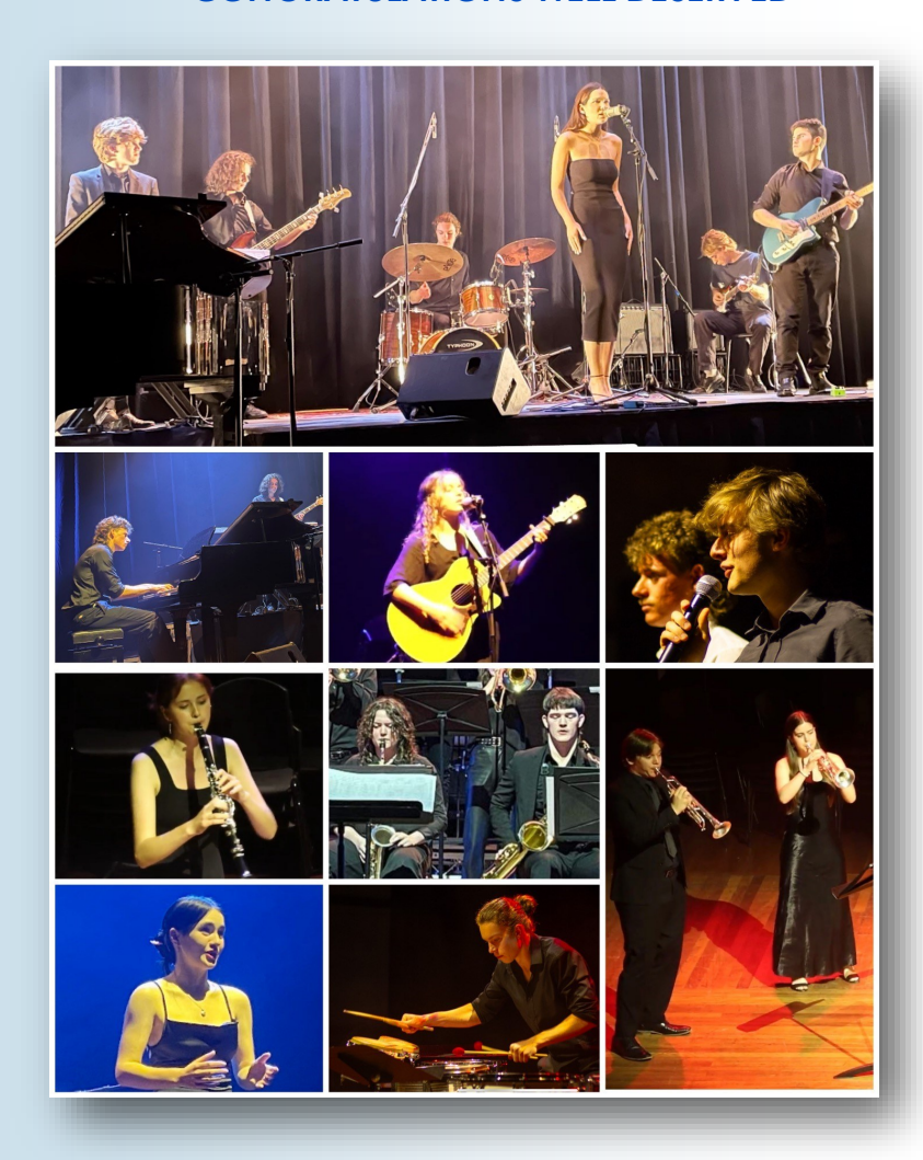
Year 12 Music students performed at the Soiree, a week before their actual HSC Practical Exams last term

Music 1, 2 and Extension cohort have received 12 nominations for Encore , the annual NESA concert of exemplary HSC performances.